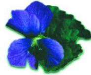
Blue Flower: Love of Country