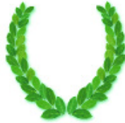
Laurel Wreath: Victory Over Death