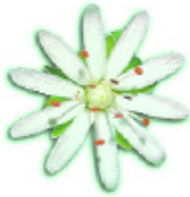
White Flower: Devotion to Duty