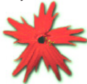
Red Flower: Courage and Gallantry